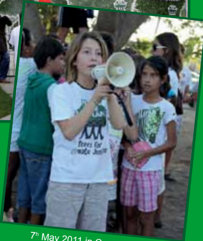
7 th May 2011 in Cancun, Mexico. Children demonstrate for a better future

Let's plant trees in each country of the world! If everybody plants 150 trees, we will reach 1,000 billion by 2020.