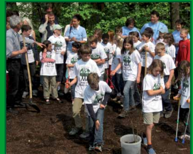
Working and planting together!

In our Initiative and Foundation, we children and young people are the bosses! Every year we vote our Global Board We want to have empowered one million children and young people in about 20,000 Academies to become Climate Justice Ambassadors and Future Lobbyists by 2020. As a large network of global citizens, we can change the world! Klaus Töpfer and Prince Albert of Monaco are the patrons of our initiative.