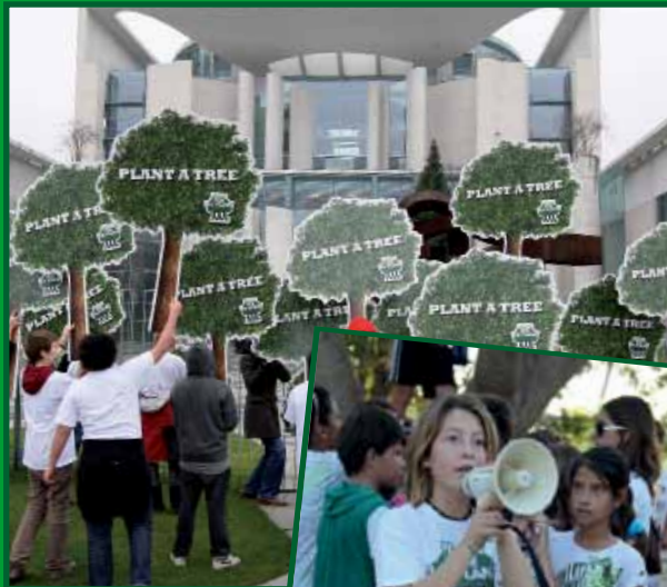
9 th December 2009, in front of the Chancellery in Berlin

If some children plant a few trees, the single tree may not affect anything, but when the children get together all over the world and plant trees, we can change the world. Antonia, 12