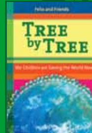
Tree by Tree - Now we children save the world (in 7 languages for 12,90 €)

www.plant-for-the-planet.org www.facebook.com/plantfortheplanet